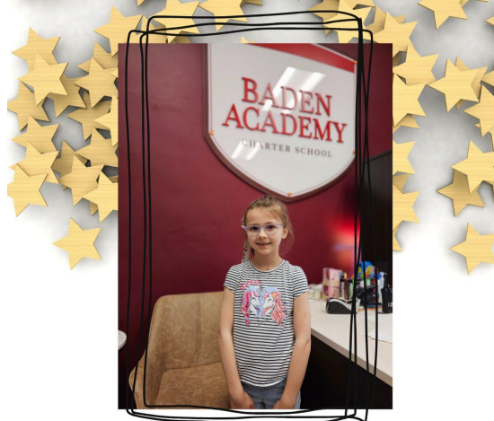
Star Writer of the Month Grades K-2