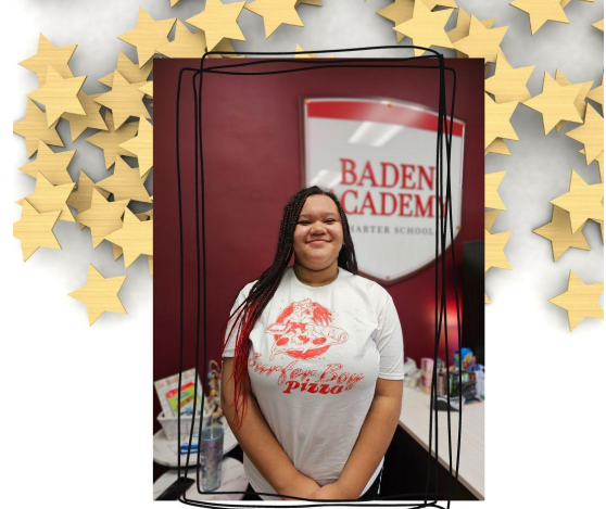
Star Writer of the Month Grades 3-6