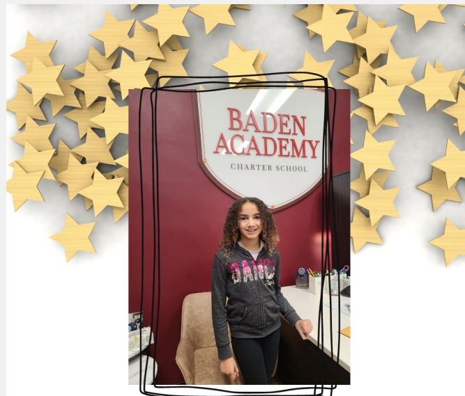
Star Writer of the Month Grades 3-6