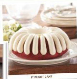
8" BUNDT CAKE