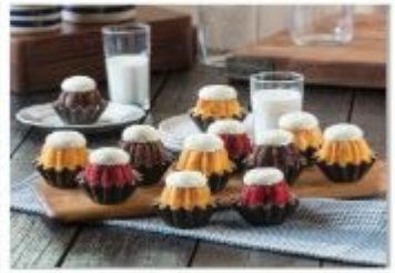
BUNDTINIS BY THE DOZEN