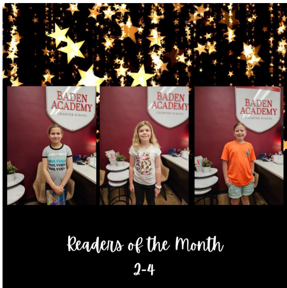
Readers of the Month 2-4