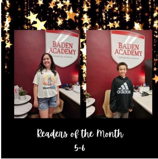
Readers of the Month 5-6