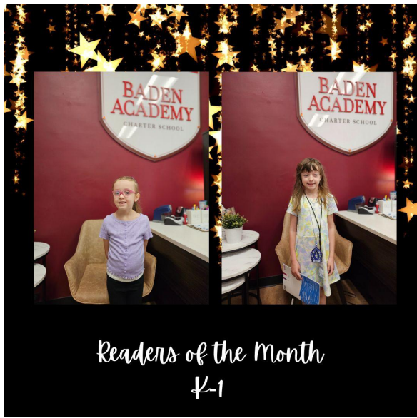
Readers of the Month K-1