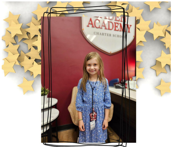
Star Writer of the Month Grades K-2